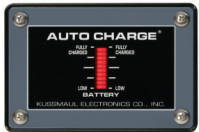
Bar Graph Display 091-199-001